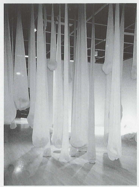
2000, mixed media, 14' \times 12' \times 12' overall