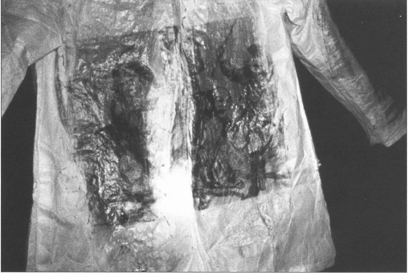
1991, b/w photo emulsion on rice paper. 11 handsewn lifesize jackets. Electrical lighting.