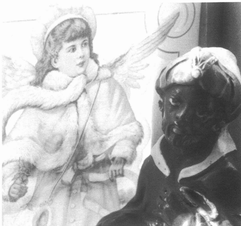
(untitled) , 1998, photograph 4" x 3½"