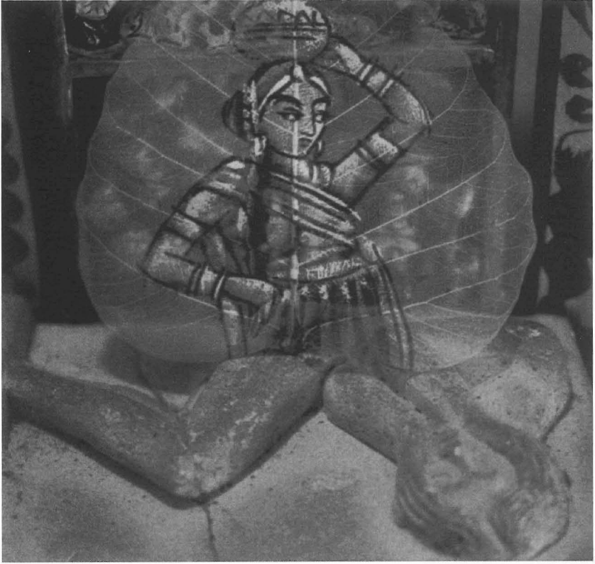
(untitled) , 1998, photograph 4" x 3½"