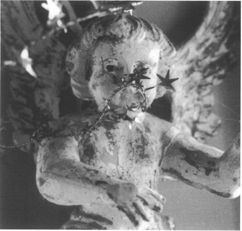
(untitled) , 1998, photograph 4" x 3½"