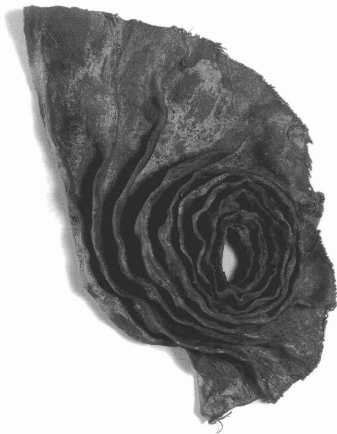
Swaddling , 1992, cement fondue, burlap, copper wire, 59 x 47 x 11cm