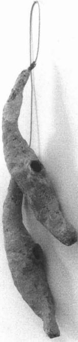
Freudian Slippers , 1991, cable, cement, cement fondue, fibreglass cloth, wire mesh, 106 x 38 x 13 cm