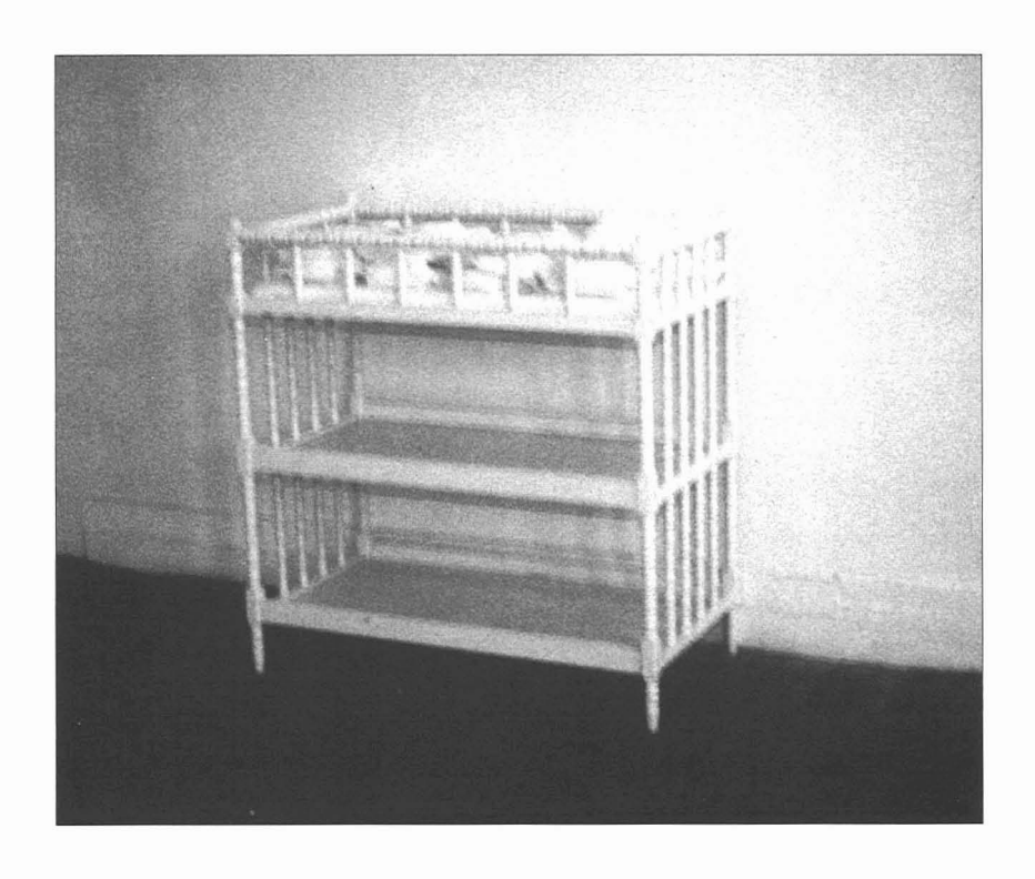
Motherlove, Wooden Change Table, Disposable Diapers, Heat Transfer, 4' x3 ½' x 1 ½' Mar.'97