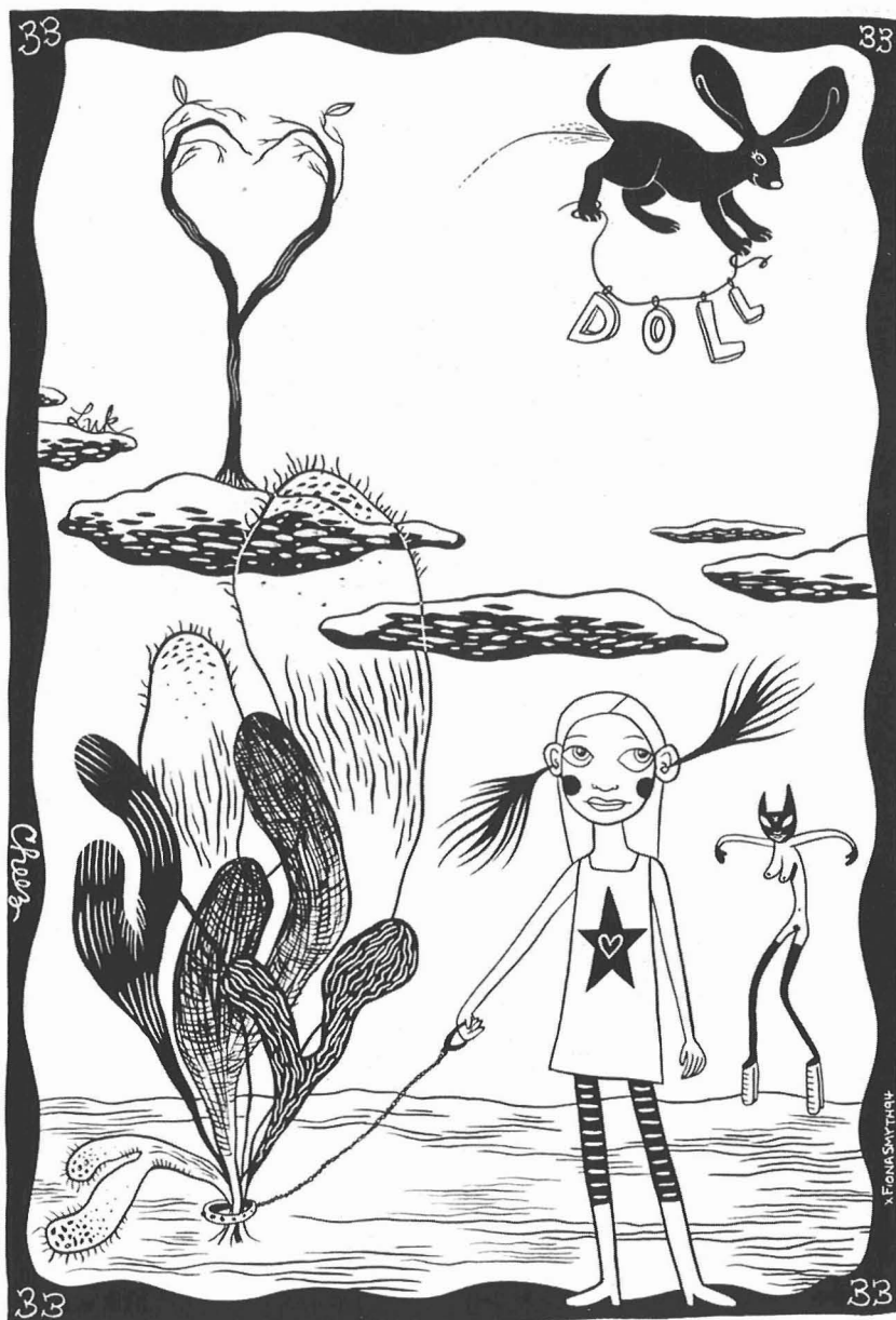
Cheez no. 33, 1995, 18" x 24" ink