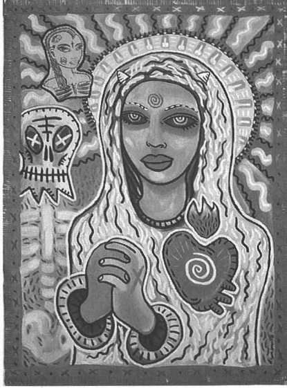
Sacred Heart , 1988, 3" × 4" acrylic